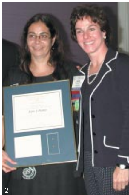
1: Visitors to the 17th annual Lawyers Expo, sponsored by the VSB General Practice Section.