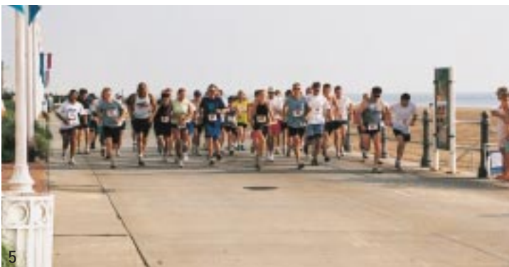
5: Virginia Lawyers Weekly sponsored the 23rd annual Run in the Sun, a 5 kilometer run on the Virginia Beach boardwalk. Other recreational activities included volleyball games and a tennis tournament.