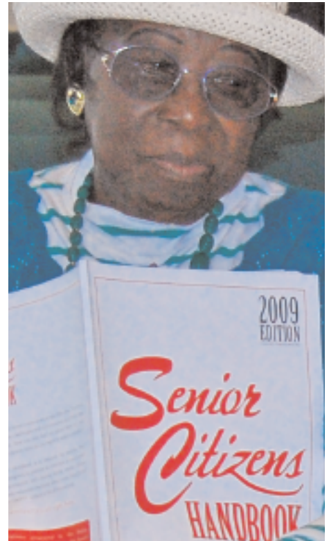
An attendee reading the revised 2009 Senior Citizen's Handbook.